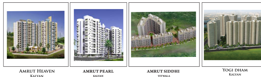
AMRUT HEAVEN KALYAN